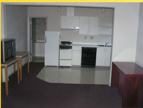
Apartment 4 Living, Kitchen & Bath; Bedroom in foreground