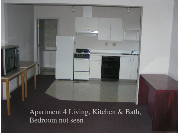
Apartment 4 Living, Kitchen & Bath, Bedroom not seen